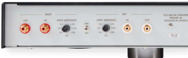
ABOVE: No XLR outputs, although the Teflon-insulated RCA sockets are top quality. Loading is selected via two rotary dials, denoting dual mono internals