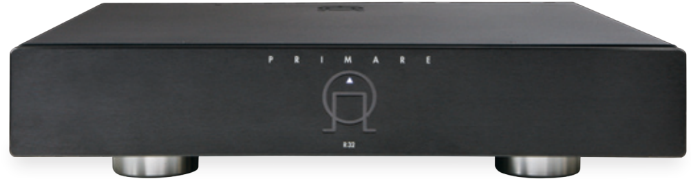
ABOVE: Thick full width front panel with cut-out logo displaying on/off looks classy. Chunky feet add to solid feel

Beginning with Harvest , I was immediately pulled into the album by the soundstage's depth which